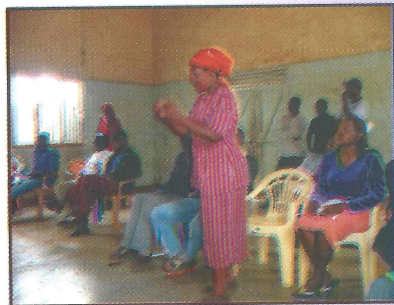
Putting corrupt and irresponsible leaders on notice

The process leading to the development of this manifesto was spearheaded by the Nairobi Peoples' Settlement Network, Muungano Wa Wanaviji and the Miss Koch Initiative and involved direct participation of the community groups in all the eight constancies in Nairobi. The manifesto has prioritized the areas that the people demand of the new government. It is but a beginning as we intend, throughout the next five years, to vigorously follow up all those issues using all the power and resources at our disposal. We shall remain vigilant every single day of the five years and the leaders to be elected are put on notice that accountability will be a continuous process. The people have woken up and the journey to genuine and effective participation has begun in earnest.